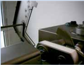
Cover of meat cutting machine, installed with corrosion resistant locking assemblies